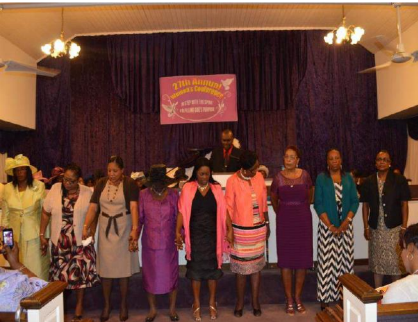
TCIBU Women's Missionary Band Executive Officers 2015-2016