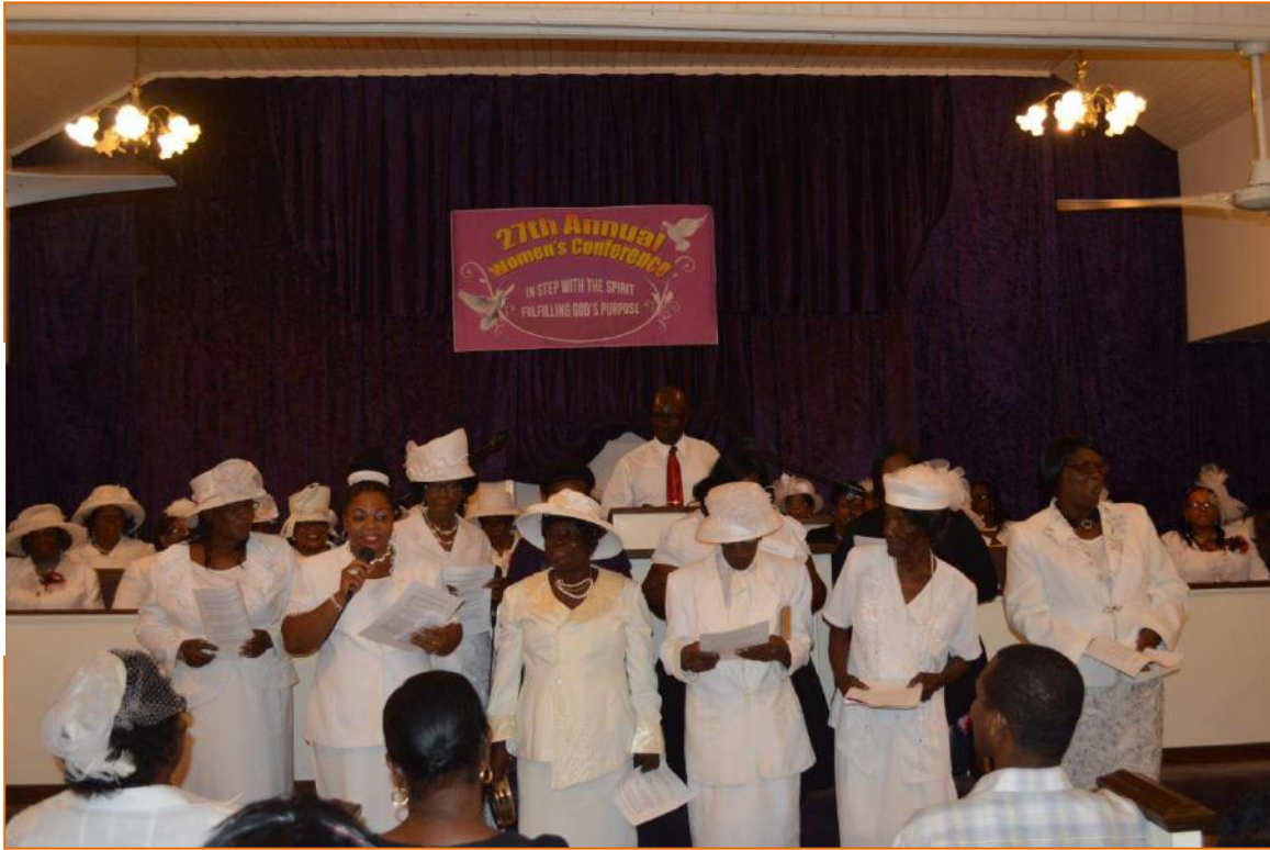
TCIBU Women's Missionary Band